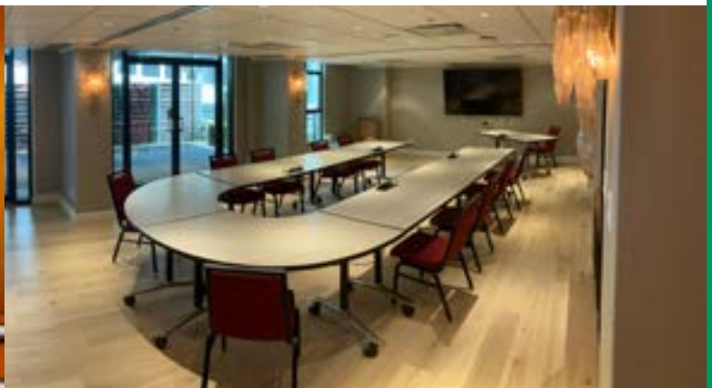
Les Etoiles Meeting room setup for a socially distanced meeting of 10 with 1 presenter and the complimentary 85" Smart TV