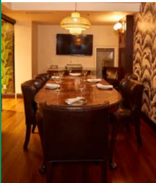
Alouette Private Dining Room with TV

Capacity: Main dining room 50 guests seated dinner & 110 guests for a reception CC's Mezzanine (upper level) 45 guests seated dinner & 80 guests for a reception + 10 in the private dining room