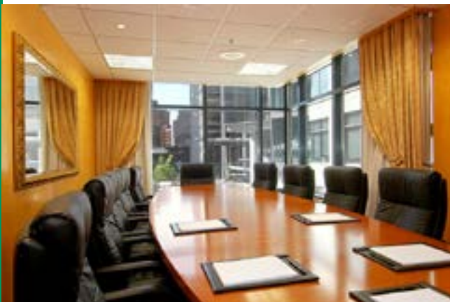
Boardroom with traditional spacing chair spacing of 10 guests.

Capacity: 12 guests seated dinner/meeting