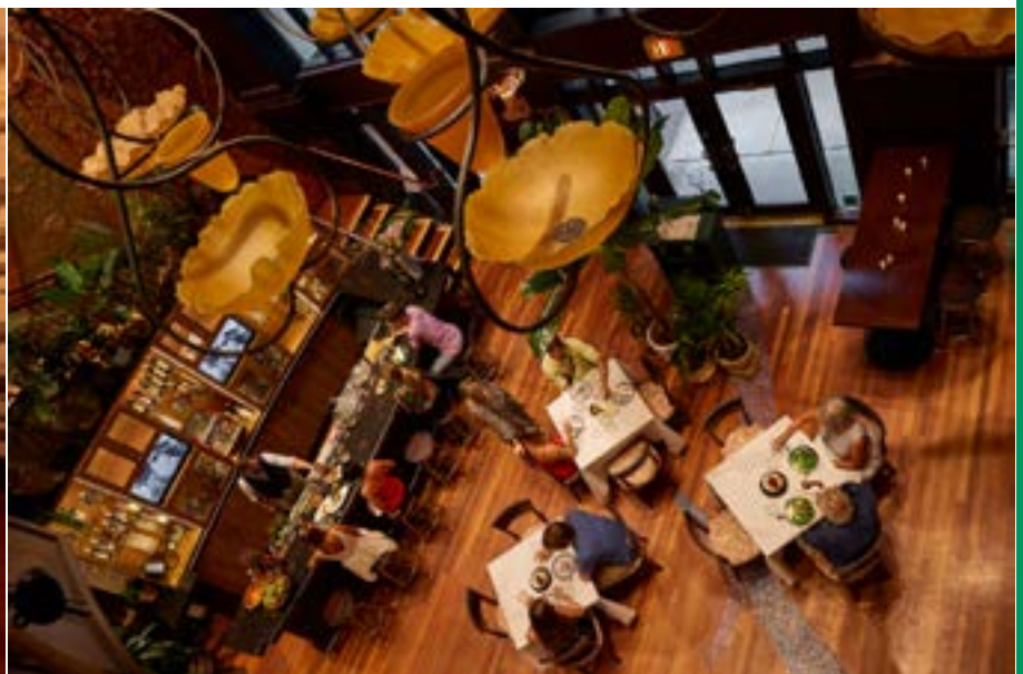
Alouette partial view of Main Dining Room as seen from second floor Mezzanine.